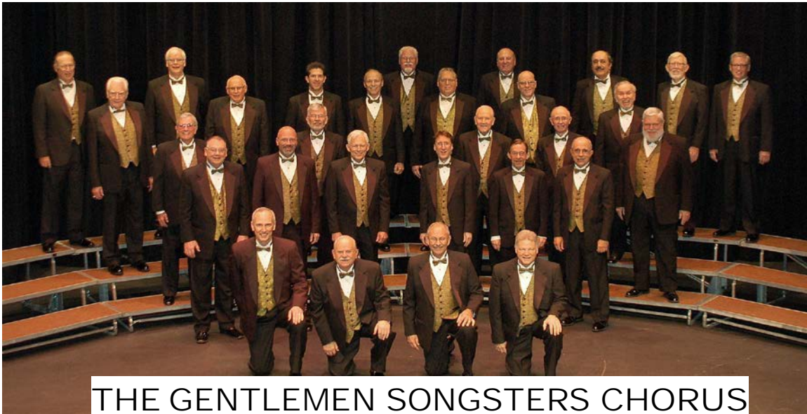
THE GENTLEMEN SONGSTERS CHORUS